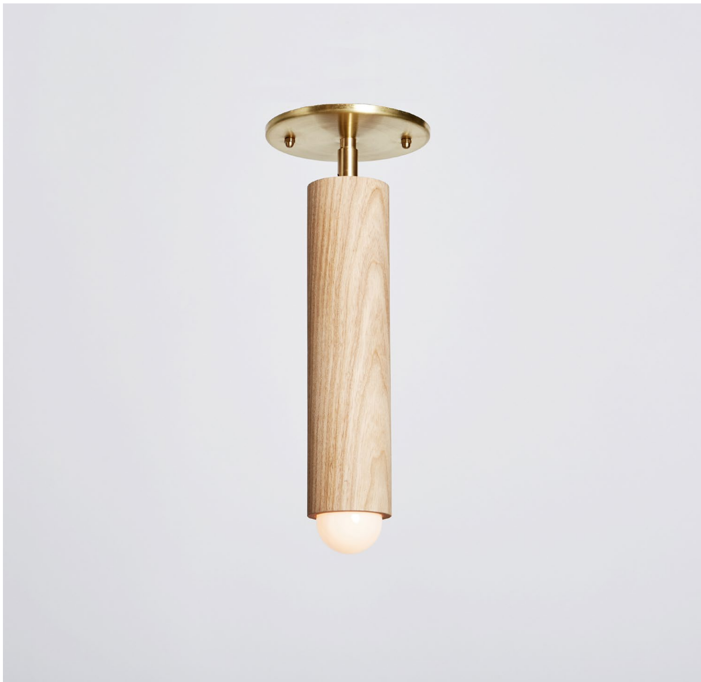
LODGE FLUSH MOUNT natural oak