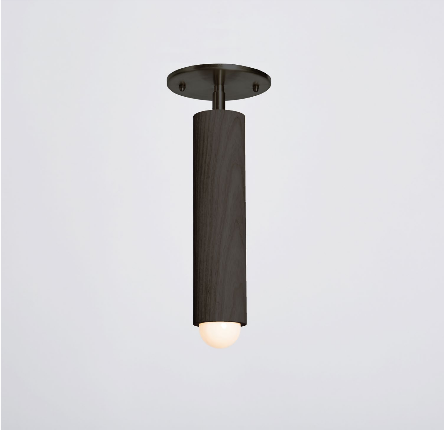
LODGE FLUSH MOUNT oxidized oak