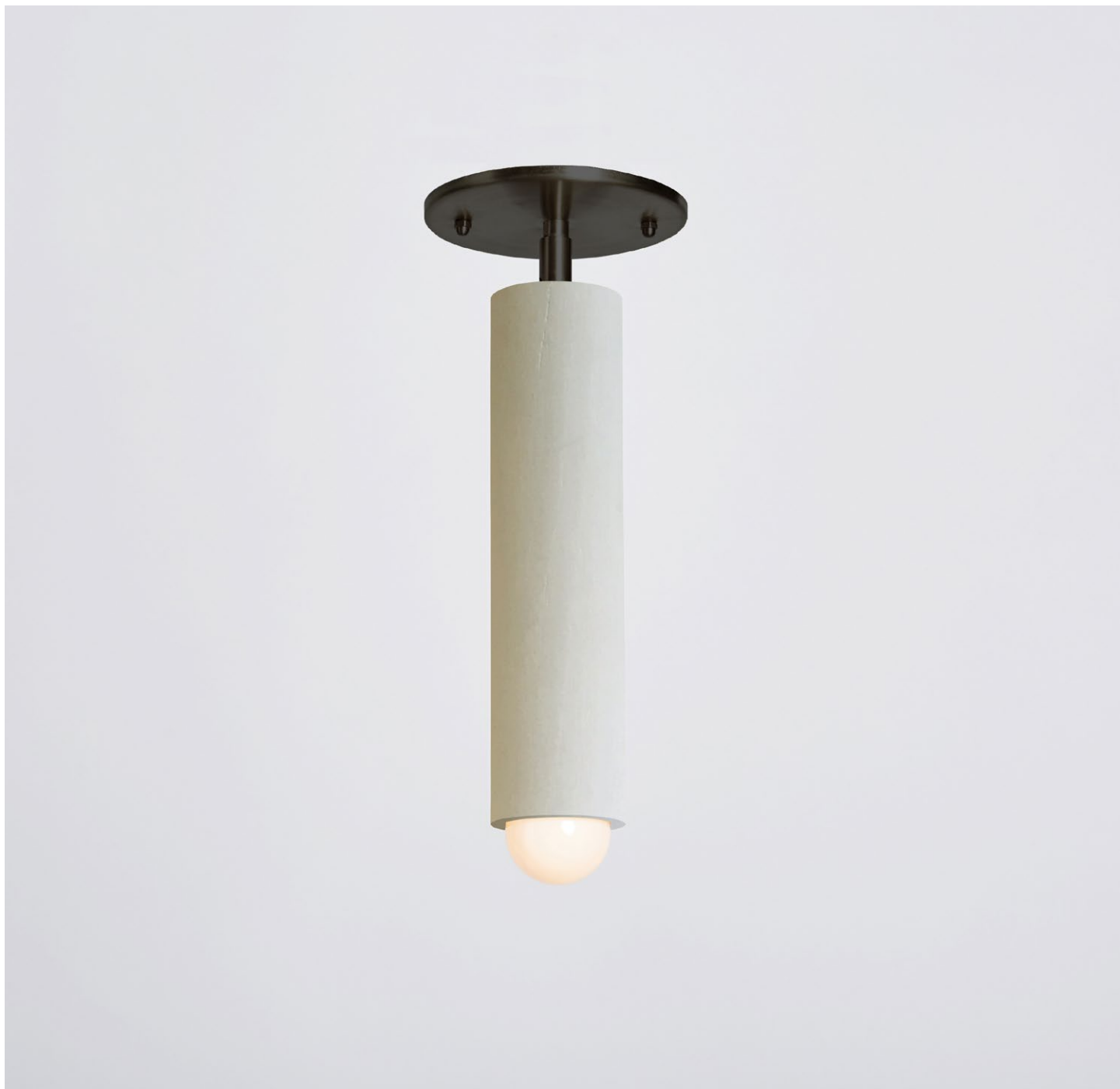
LODGE FLUSH MOUNT bone white