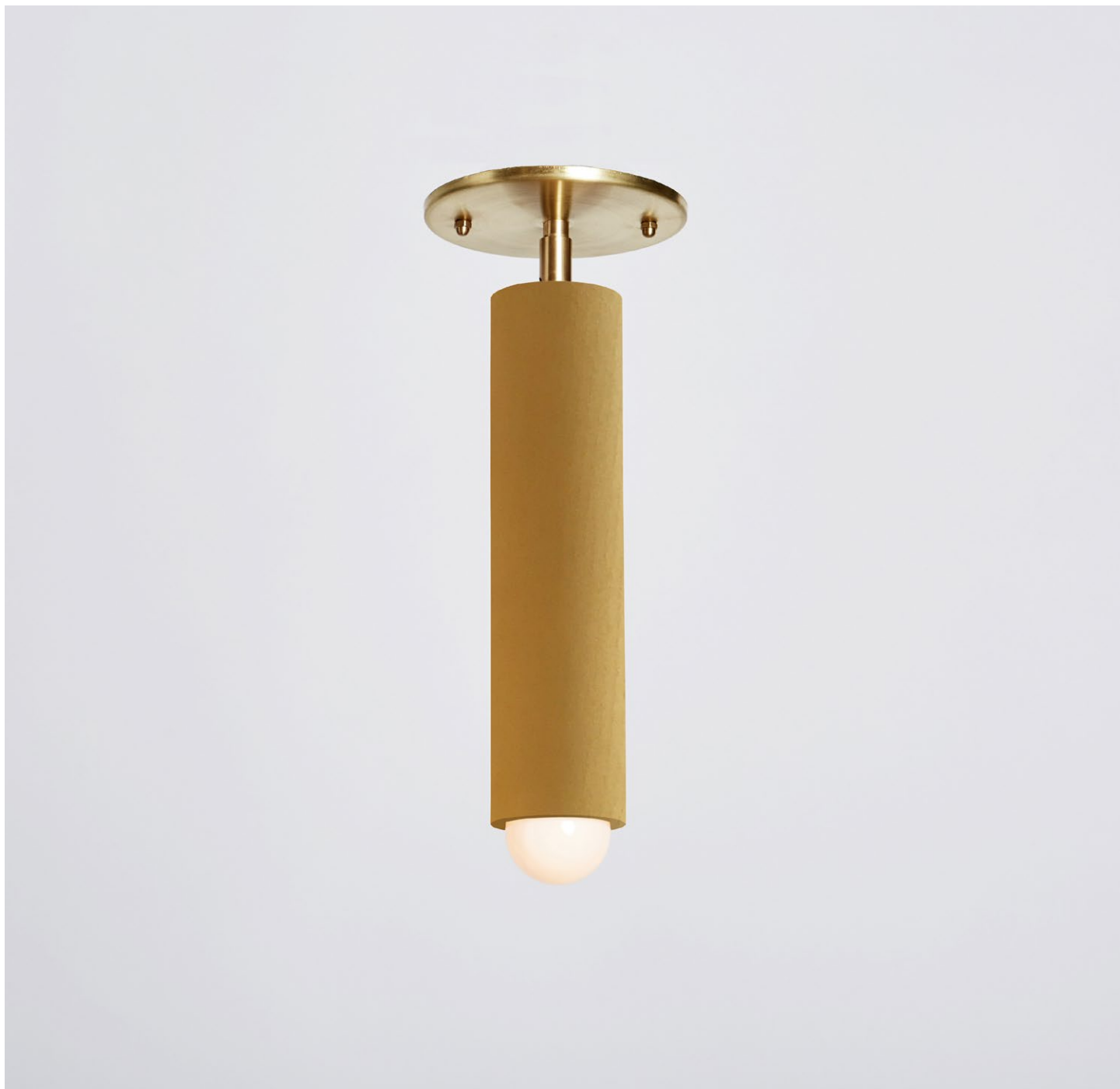
LODGE FLUSH MOUNT yellow