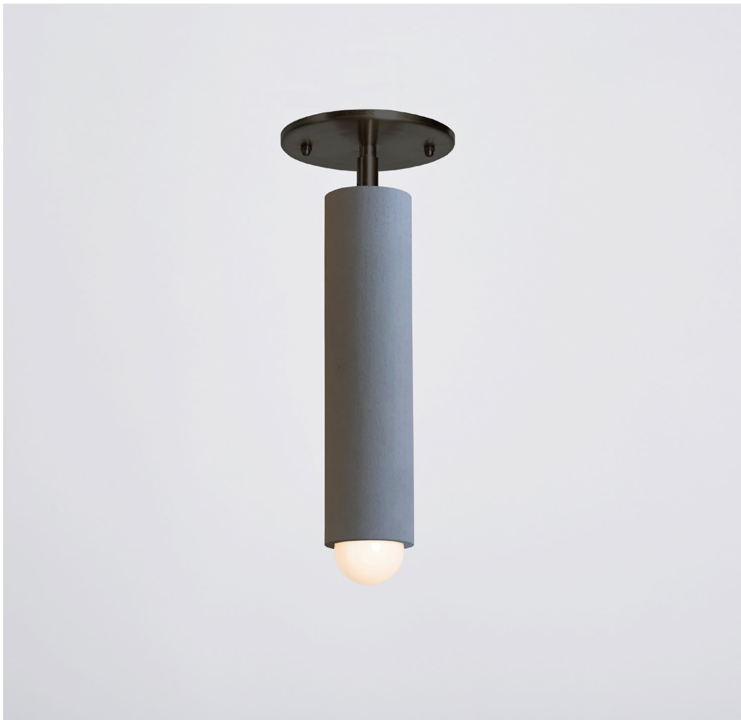
LODGE FLUSH MOUNT gray